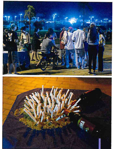
Photos from top to bottom: Pioneering gathering in Indaiatuba in April; some young people getting a drink and exploring moving into the next stations; messages of God's promises shared with the young people